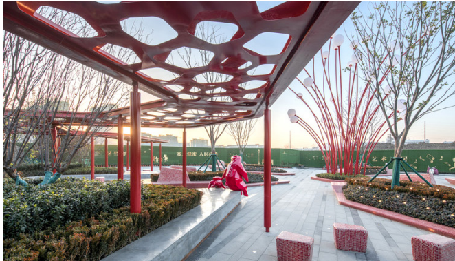
Integrated Park Elements