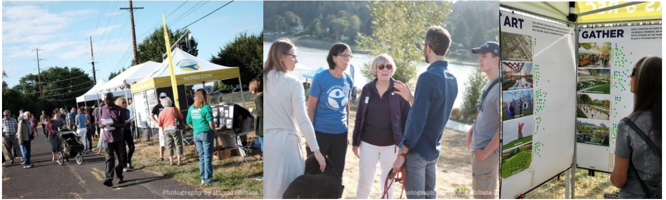
Kick-off event to celebrate in the park and engage the public in the design process (Aug. 2018)