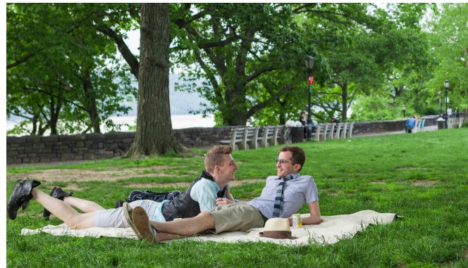
Trees & Lawn