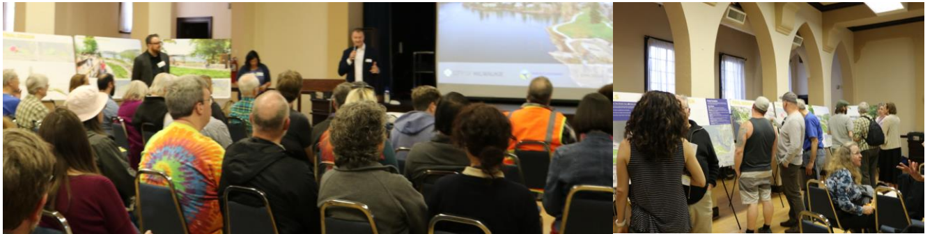
Presentation of final design and community conversation to discuss ideas and next steps (Apr. 2019)