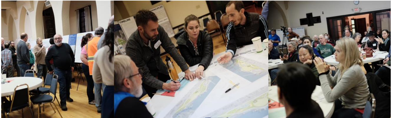
Workshop to discuss and provide feedback on design alternatives (Nov. 2018)